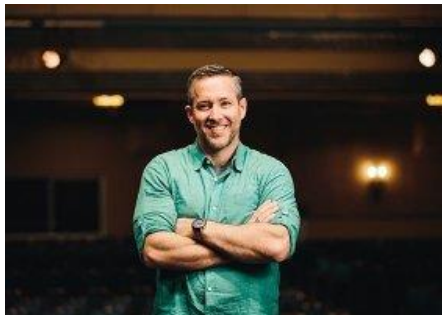
JD Greear - Current president of the Southern Baptist Convention

In June, the Southern Baptist Convention officially adopted Critical Race Theory — an anti-Biblical worldview that treats every circumstance in society through the lens of racism — as a “useful tool” for analyzing racism in our churches and society.