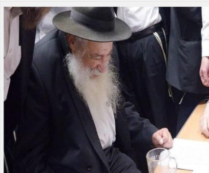
Rabbi Avigdor Nebenzahl

The former Rabbi of the Old City of Jerusalem and one of the leading rabbis in Israel today said in an interview: "we must do everything in our power to build the Temple".